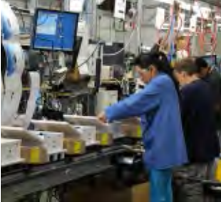
Hayward® Industries, Inc.