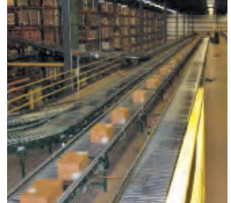
Ocean State Job Lot