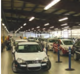
North Atlantic Distribution, Inc.